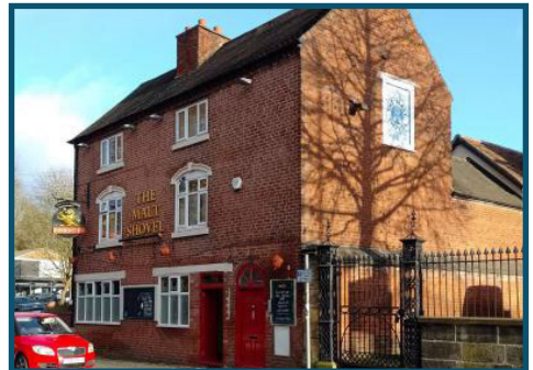
The Malt Shovel, Dudley