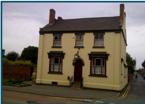
The Beacon, Sedgley

Wednesday dawned and a cracking breakfast was enjoyed. We took the tram to West Bromwich with a view to doing a Wetherspoons - The Billiard Hall opposite the bus station. On arriving we found someone else now owns the pub, so we went to Walsall just for a quick wander round as it was still quite early. From there the 529 bus took us on to Wolverhampton and the Moon Under Water Wetherspoons where we had our first pint of the day which we forgot to