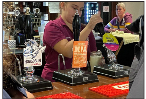
Lindley Liberal Club

Thank you to Lindley Liberal Club, The Sportsman Huddersfield and The Tap House Holmfirth for hosting our recent Branch meetings.