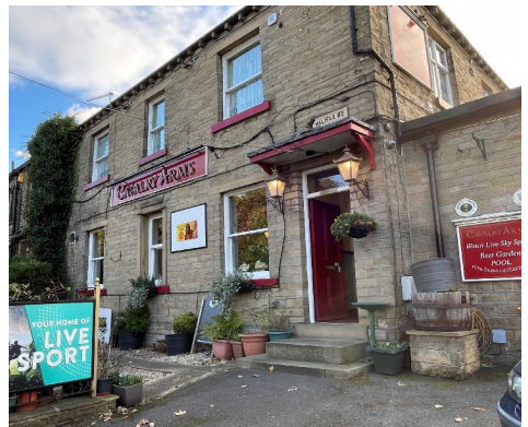
Cavalry Arms, Birchencliffe