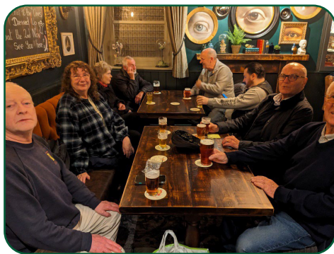
Shoulder of Mutton

Instead, we went into the newly refurbished & reopened Shoulder of Mutton . It has been decorated to a high standard, though some of the wall art is a bit strange. Taylor's Landlord , Theakston Best Bitter & Bradfield Farmers Blonde were on offer, alongside Westons Old Rosie Cider .