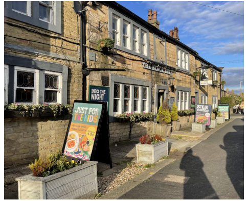
Black Bull, Lindley